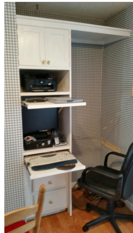
Compact computer center. Washer/Dryer combo to be placed in space to right Year 2016