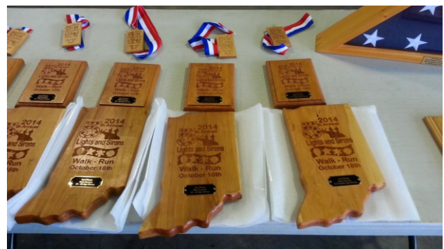
Cherry plaques made for local 5K event. The laser etching and plates were done by local trophy business. Year 2014