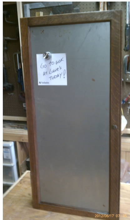
Spice cabinet. Frame is from salvaged lawyers lateral file. Door is metal for magnet use. Customer hoping metal to rust. Year 2011