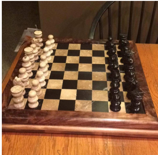
Walnut Base and frame to repair broken chestboard. Year 2016