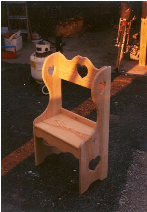
Pine narrow bench for neighbor. Customer painted to their own preference. Year 1986