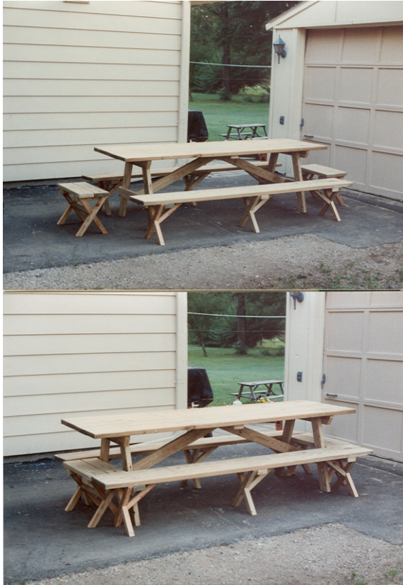
Picnic table for neighbor