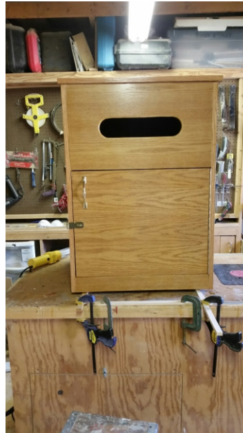
Red oak Book return box. Made for local high school library. Year 2016