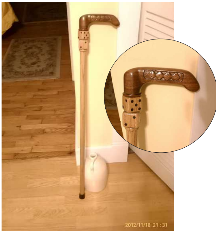
Walking Cane for Co-worker Year 2011