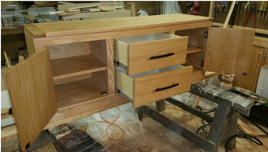
Red oak entertainment center. large screen to set on top with storage below Year 2015