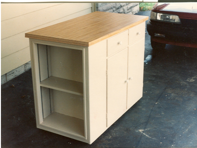
Small kitchen island with storage. Rolls around Year 1989