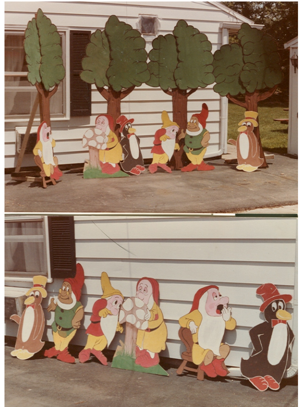
Stage props for local dance studio