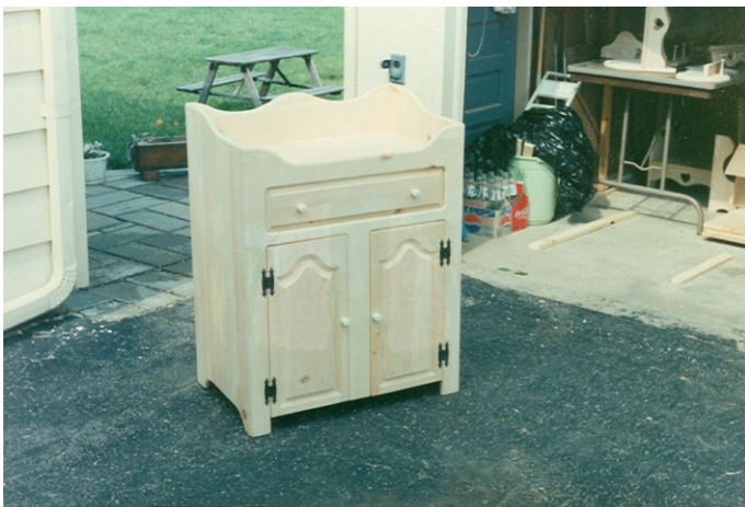
Pine Dry Sink. Customer painted to their own preference. Year 1986