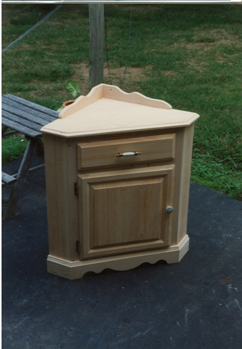
Pine Corner cabinet. Customer painted it to their own preference. Year 1986