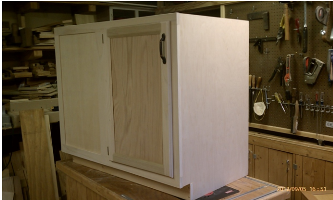
Poplar and plywood blind corner cabinet for kitchen. Year 2014