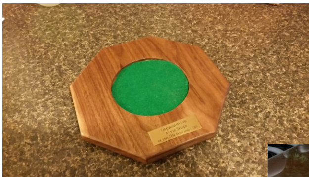
Crystal bowl base made to display crystal bowl that is being shipped to Japan as gift from local industry. Made from Walnut Year 2016