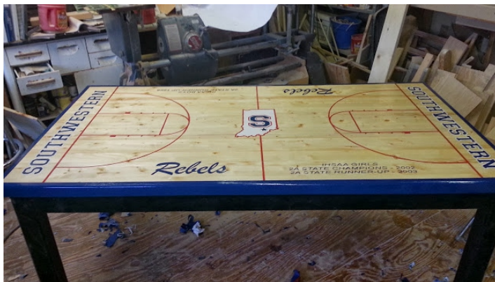
1/16th scale basketball floor on table made of pine. Table built for local high school Sports department conference room. Year 2015